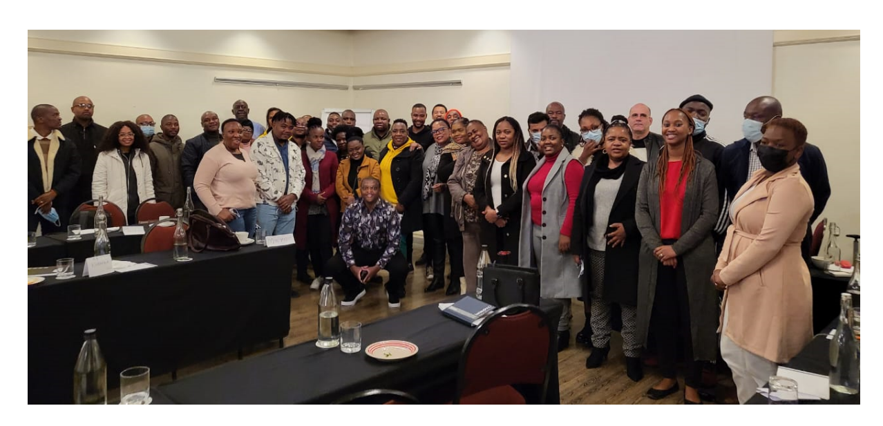
Clinical Mentorship training for Districts in Gauteng Province (group A)

In 2022, the West Rand District participated in the Clinical Mentorship programme to ensure that their 30 VMMC-trained DoH health workers had sufficient skills to perform the VMMC surgical procedure. This was made easier by the availability of the district-based MMC SUSTAIN Project Manager, who was certified to provide mentorship support and oversight for Clinicians seeking VMMC mentorship.