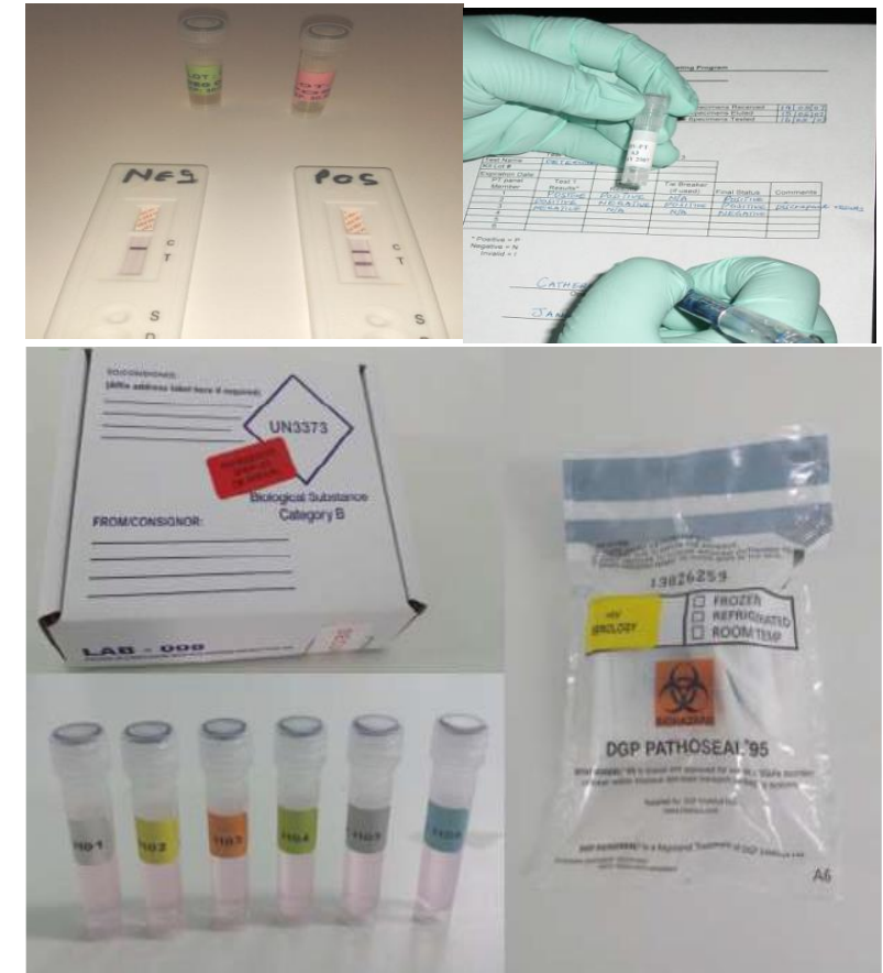
Figure 1: PT Packaging